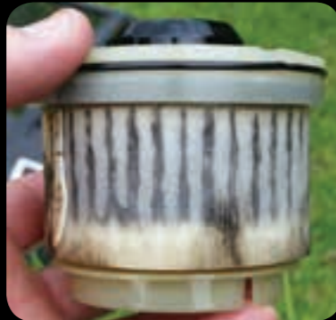
Image Above: A contaminated fuel filter after only 3000km of highway driving in a Hilux.