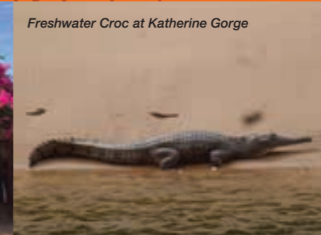
Freshwater Croc at Katherine Gorge