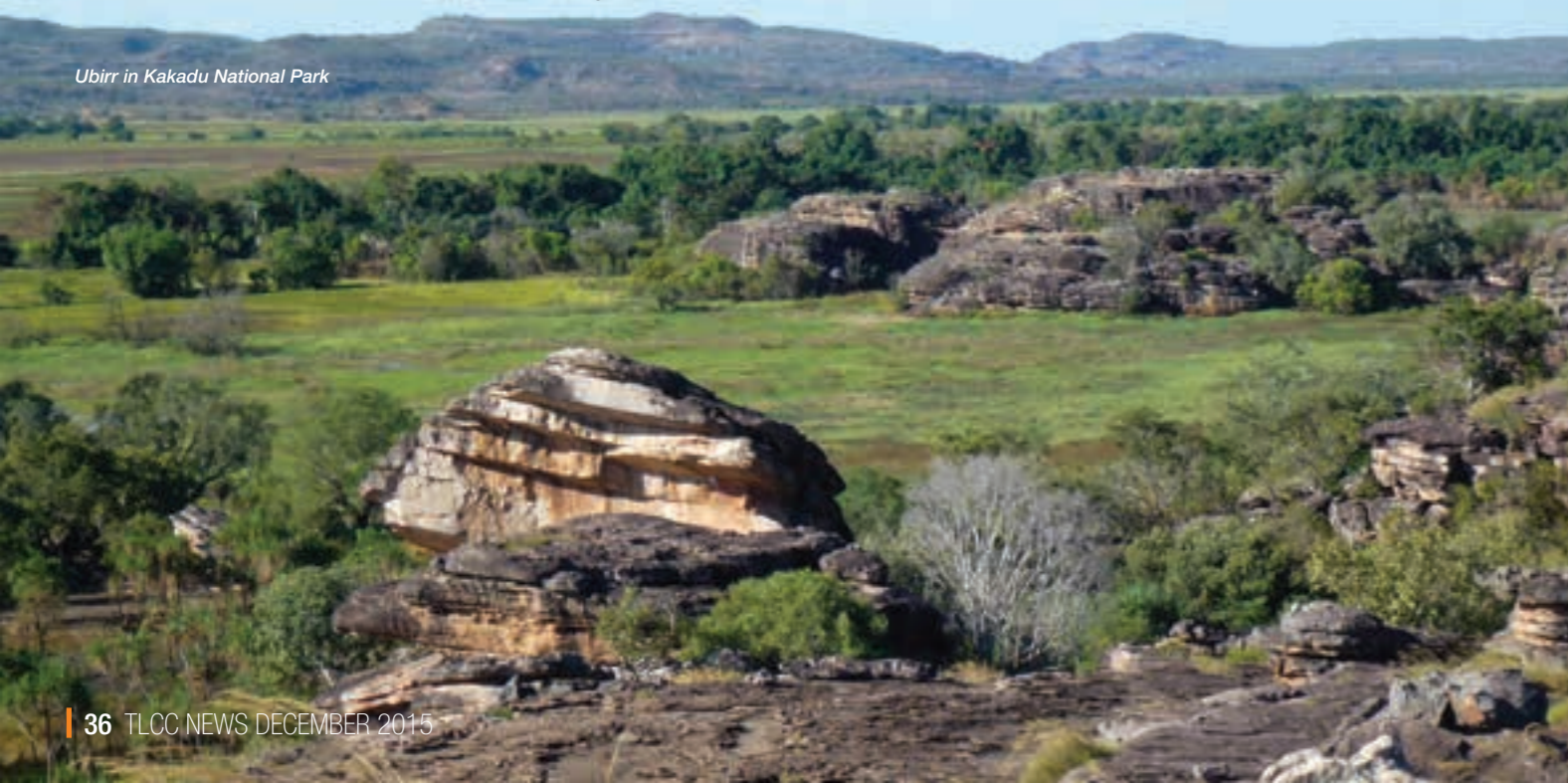
Ubirr in Kakadu National Park

Back on the road heading towards Jabiru for lunch everyone bought something from the bakery. We then headed off to our campsite for the evening at Meri. There was a demonstration