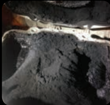
Image Above: A blocked Inlet manifold due to carbon buildup on a Land Cruiser 70 series V8.

EGR gases combined with oil vapor from crankcase form carbon deposits in the intake system of the vehicle, leading to poor performance, reduced fuel economy and costly repairs.