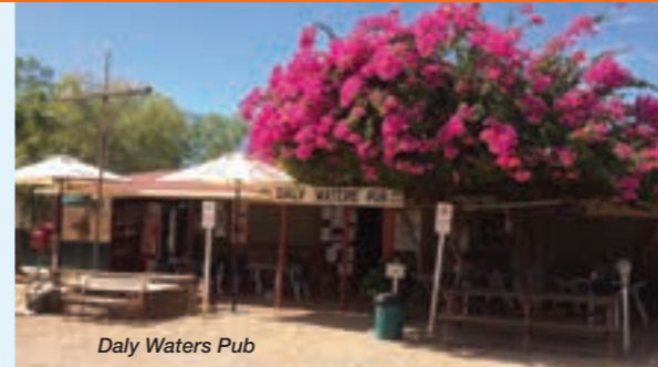
Daly Waters Pub

Our day started as we had booked a four hour cruise through the Katherine Gorge system in the Nitmiluk National Park. Due to the possible presence of saltwater crocodiles, no swimming or canoeing was allowed in the main river. We travelled by boat through the first three gorges and climbed up to a waterfall where we all enjoyed a safe swim free from crocodiles. Nitmiluk National Park lies between the monsoonal tropics and the arid zone which is dominated by a yearly cycle of flood, drought and fire. Our journey through the gorge system consisted of a boat trip through each individual gorge followed by a walk, to the next boat. We spotted a small amount of bird life including herons and